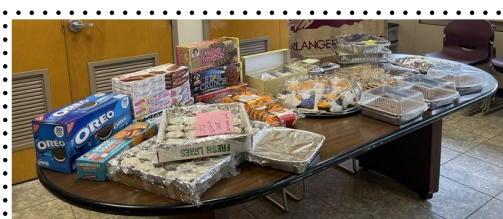
St. Henry Dessert Donations

We posted on Facebook the need for dessert and our generous donors came through again. Thanks to all those who answered our call. We also want to thank everyone at St. Henry Catholic Church who donate desserts every month for the Parish Kitchen! Our guests love desserts! We always need homemade and boxed desserts.